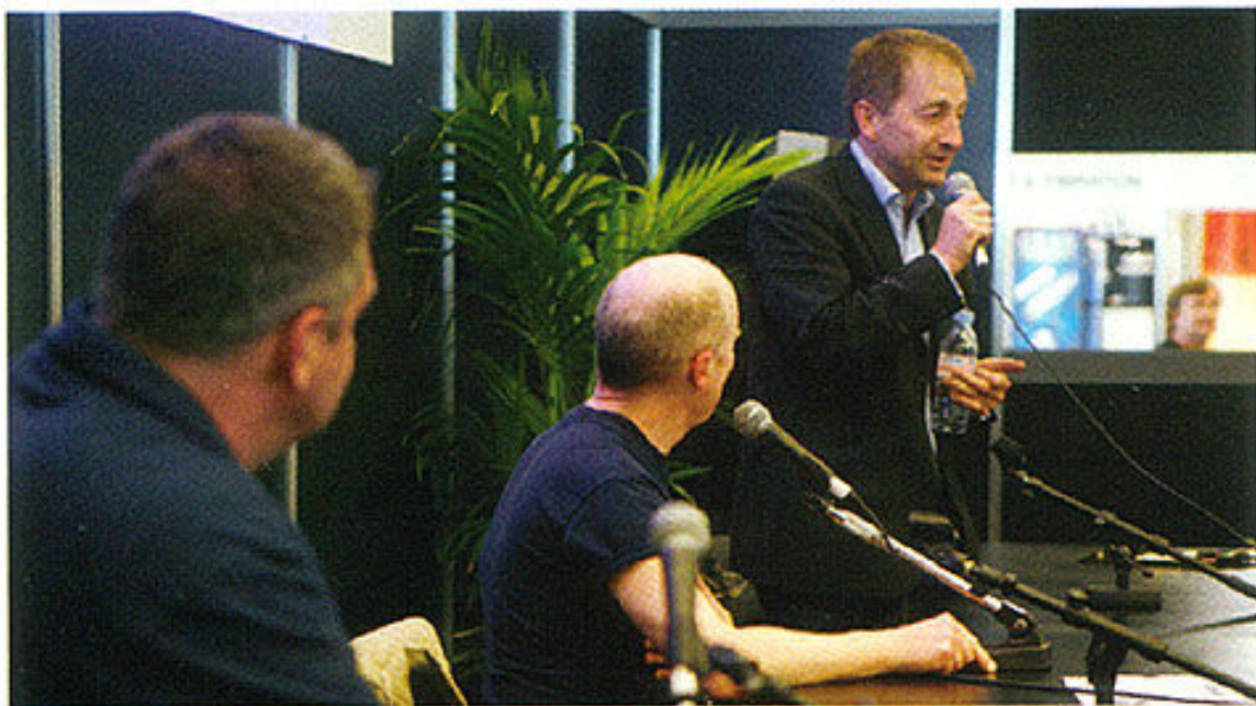
The Sunday broadband Application Seminar: all stream ahead