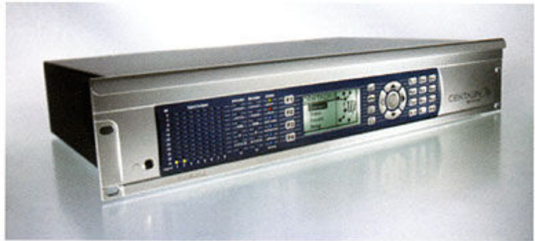
The MAYAH Centauri II Audio Gateway Codecs is another popular codec